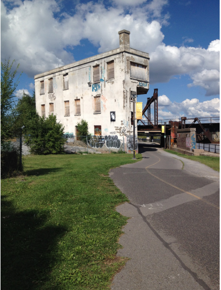
Image 1 - The Wellington tower, Griffintown, Montreal, 2014.

art history, museum education, architecture, design, theatre, and performance studies. In autumn 2013 we co-authored a proposal to the city of Montreal. 7 Our brief did not propose, however, a retrofit design for the building; in fact, we did not propose a vision for a