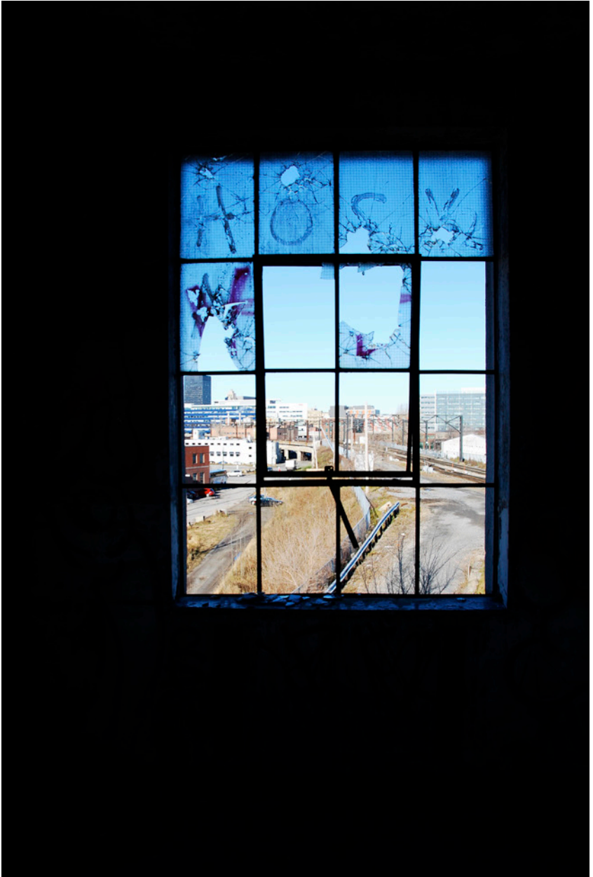
Image 2 - Interior of the Wellington tower, 2009.