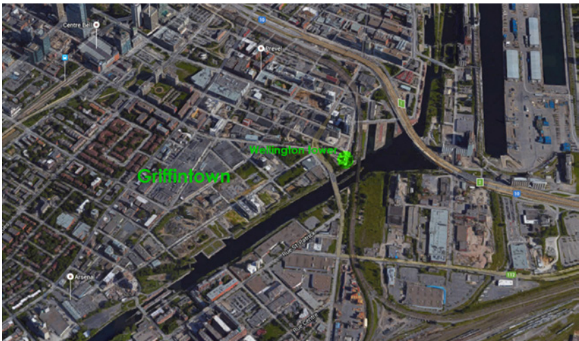
Image 4 - Aerial view showing Griffintown in 2015.

Griffintown is inextricably linked with the history of Montreal's industrialization, urban development, and deindustrialization. Eighty-four hectares of urban land comprise the district, which is located in Montreal's southwest borough, and situated adjacent to the Lachine Canal, today a National Historic Park. In the eighteenth century Griffintown was considered to be the city's first suburb. 17 It formed in tandem with Montreal's industrial revolution, which attracted immigrants from the United Kingdom, some of whom brought with them technology, science, and capital, and went on to acquire fortunes through the railway, tobacco, and sugar refining industries. 18 In contrast to this small elite, the majority of immigrants arriving in Montreal were poor, uneducated, and Irish Catholic. Griffintown is where many such immigrants settled. The neighbourhood's industrial growth meant that its residential density