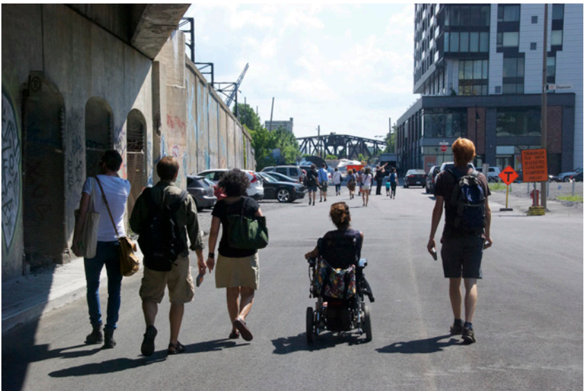
Image 15 - Participants traversing Griffintown during the Spatial justice urban lab, 26 July 2014.

As participants wove their way along the precarious route between the Darling Foundry and the Wellington tower, we asked them to identify and mark moments of what they considered to be spatial injustice. This directive resulted in the discovery of diverse instances of inaccessibility and injustice, including physical constraints for all those who are not normatively mobile, the auditory and olfactory barrages of a construction site, and the more subtle visual obstructions that slip into social barriers, such as the planters lining the sidewalk in front of a new upscale cafe, just a few meters from a homeless squat, or a homophobic statement scrawled across