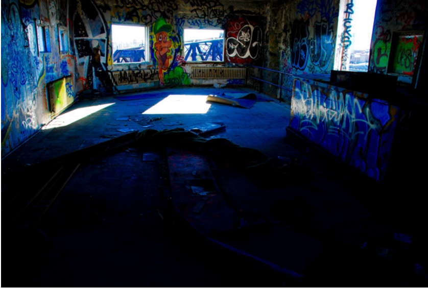
Image 3 - Interior of the Wellington tower, 2009.

The expression “points of view” thus had several senses for us. The Wellington tower inspired the first of these, as it was designed to facilitate multiple views over Montreal’s then-industrial heart, the Peel Basin. The tower’s windows were, at the time our project began, boarded up but they still had the potential to be literal apertures onto a changing urban landscape, while summoning the histories of labour that are disappearing from view throughout the city’s formerly industrial core. The second sense of the phrase was tied to the tower’s cultural landscapes, which are, as of this writing, still mutating. These include: the cultural landscape of labour and industry; the cultural landscape of homelessness and itinerancy; the cultural landscape of ruderal urban ecologies, and the cultural landscape of urban renewal, destructive as this is of the other landscapes. And finally, we saw our project as enacting and enabling different voices and points of view about the encounter with these cultural landscapes. A key means for us to access all these points of view was to walk (or if walking was not possible, roll). In traversing the distance from the Darling Foundry to the Wellington