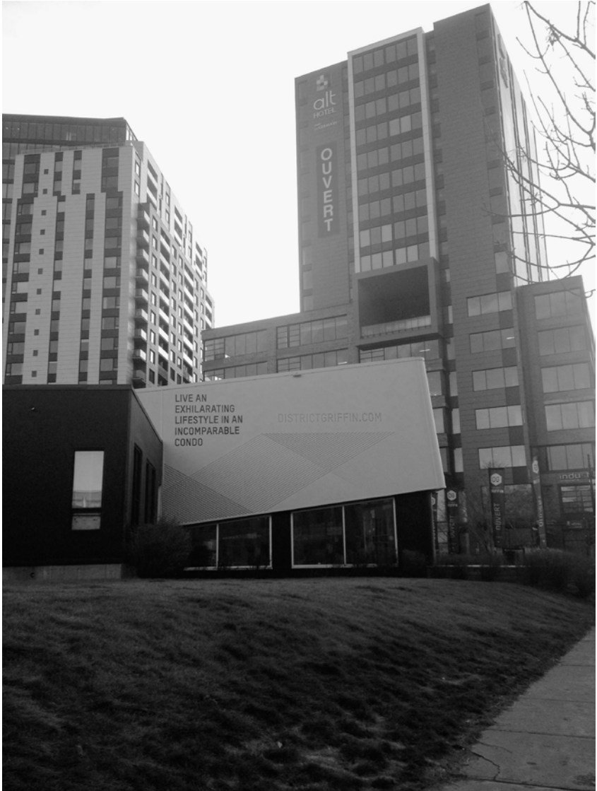
Image 11 – Alt Hotel in background; District Griffin sales pavilion in foreground, 2015.

is synonymous with an eclectic mix of residents, a sparkling sense of community, and a taste for the good things in life.” 33 Griffintown has even been touted as Canada’s “next great neighbourhood.” 34