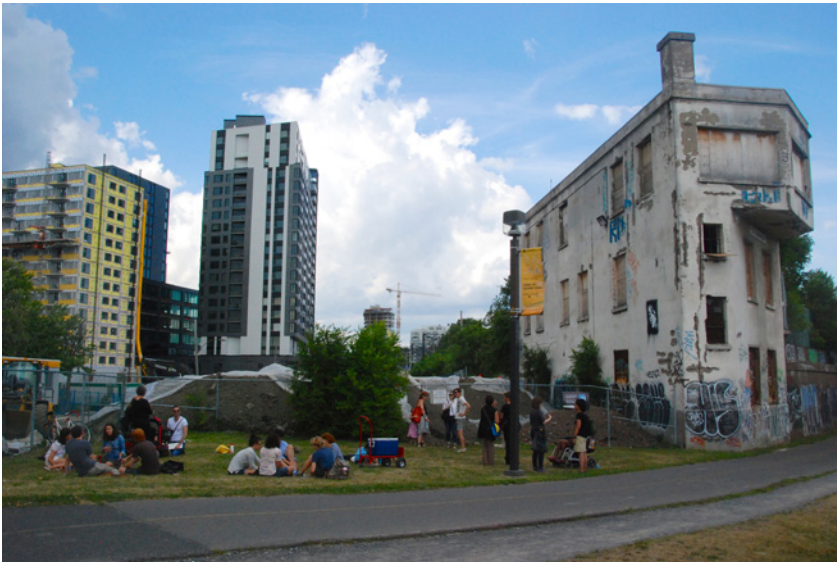
Image 12 - Points de vue's urban lab #2: Participants seated on the grass adjacent to the Wellington tower.

The discourse on Griffintown as a previously blighted, even dangerous urban site, socially and culturally disinvested, laid the groundwork for the market-driven revitalization and served in turn to justify the lack of public consultation. Tropes such as revitalization and rehabilitation position profit-driven development as the fast lane to better urban futures, as an unimpeachable source for the life of the city itself. What this powerful discourse obscures, but does not entirely eradicate, are smaller, interstitial, cumulative urban dynamisms, such as postindustrial ecologies, and the intensely creative, socio-spatial survival strategies of less visible, under-resourced urban agents. The politics of space are particularly acute in this part of Montreal at this time. Griffintown is thus a powerful site for artistic engagement in and with those politics. 35