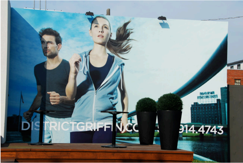
Image 8 - Billboard advertising "District Griffin" condominiums, 2011.

heritage. The sector is literally unrecognizable from five years ago. Janssen observed in 2014 that at that time "it was increasingly difficult to discern between the ruins of deindustrialization, what was being rebuilt, and what was being ruined as a direct cause of Griffintown's revitalization." 28