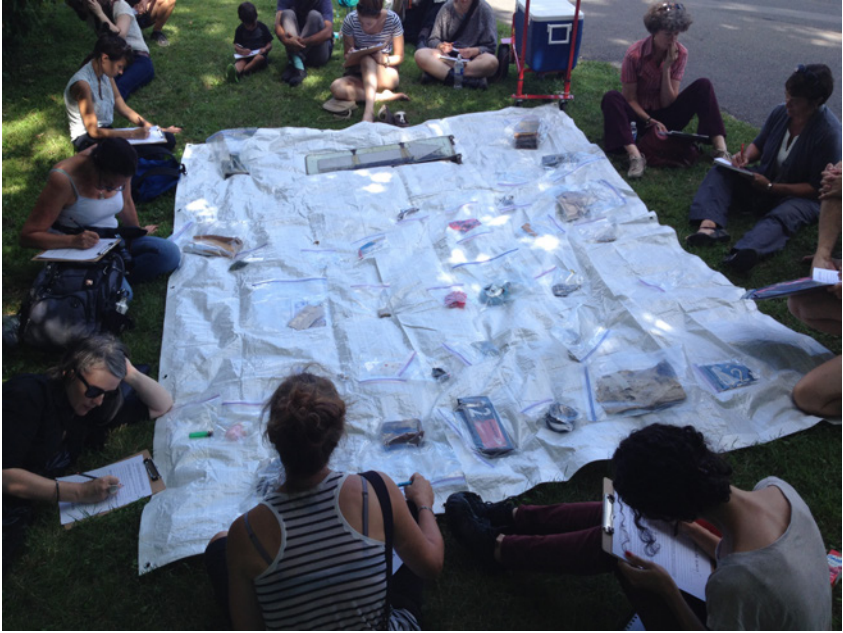
Image 22 - Participants with urban naturalist Roger Latour during the Urban greening lab, 13 September 2014.

Parking lots, cracks in the sidewalks, and abandoned lots revealed how the neighbourhood's location alongside a canal and an active railway track had resulted in a wonderful variety of plants. Despite the wet weather, participants collected end of season specimens, including prairie grains (various types of wheat and grasses), herbs (plantain, catnip), flowering plants (goldenrod, Lady's thumb, toadflax, and clover), and food (dandelion, Riverbank grape). We had expected the participants to only take small samples of the plants they found interesting. However, inspired by their discoveries, they took ever larger samples of the early autumn plants. The sense of precarity was acute, not because our participants were busily chopping away at the early fall growth, but because caution tape, orange plastic cones, and notices informing the public of imminent construction showed us, with great immediacy, that these spaces and plants were not going to be flourishing for much longer. The