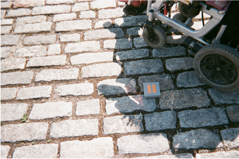
Image 16 - Spatial justice emblem, urban lab, 26 July 2014.