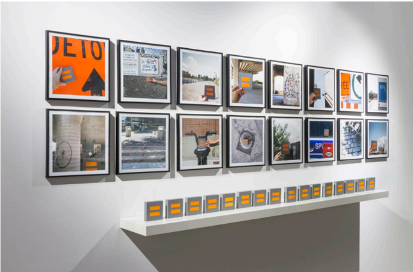
Image 17 - Spatial justice urban lab outcomes, as shown in the exhibition at the Darling Foundry, September 2014.