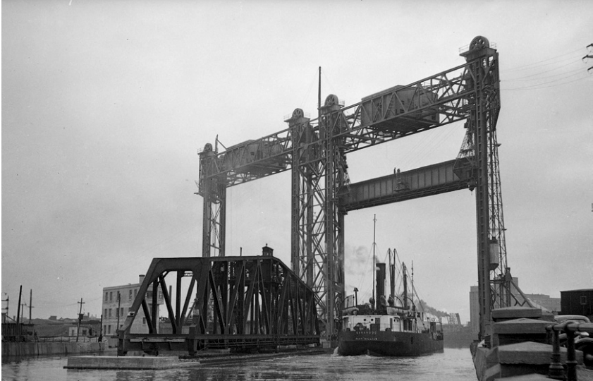
Image 7 - The swing and lift bridges, Peel Basin, Griffintown, 1943. The Wellington tower is visible at left behind the swing bridge.

specialized labour; many of the jobs associated with this tower, such as switchman, signalman, movement director, and bridgeman, live on in memory only.