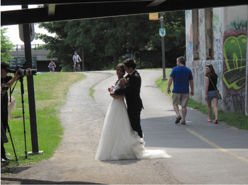
Image 10 - The bicycle track in front of the Wellington tower (visible at right), July 2014.

we undertook Points de vue, within a few hundred feet from the tower's boarded up windows and graffitied surfaces. During one of our preparatory walks on a sunny Saturday in July 2014, we saw a bride in a $10,000 dress sweeping towards the tower from rue Peel. A wedding photographer, with an entourage of several well-tanned men in tuxedos, scampered after her on the bicycle track that runs adjacent to the Lachine Canal. Just before she reached the Wellington tower, the bride posed against the backdrop of a tiny vegetable garden that an itinerant community has planted, illegally, on the ramparts of the Canadian National railway tracks, for food.