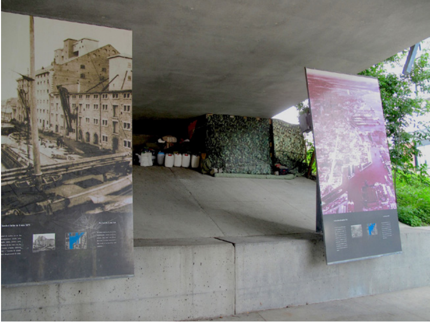
Image 9 - Contingent shelter approximately 150m from the Wellington tower, 2014. Note the new colour panels lauding the district's industrial past.

city or the developer's goals. 30 Less frequently mentioned were the needs and rights of the long-term residents of the district, many of whom are, or were, homeless, transient, or economically marginal. These individuals are being squeezed into ever smaller and more precarious corners of what has become an epic building site. In contrast, the billboards advertising the new condos suggest that thousands of new units have been designed exclusively for upwardly-mobile, able-bodied, heterosexual couples (mostly white) in their early twenties.