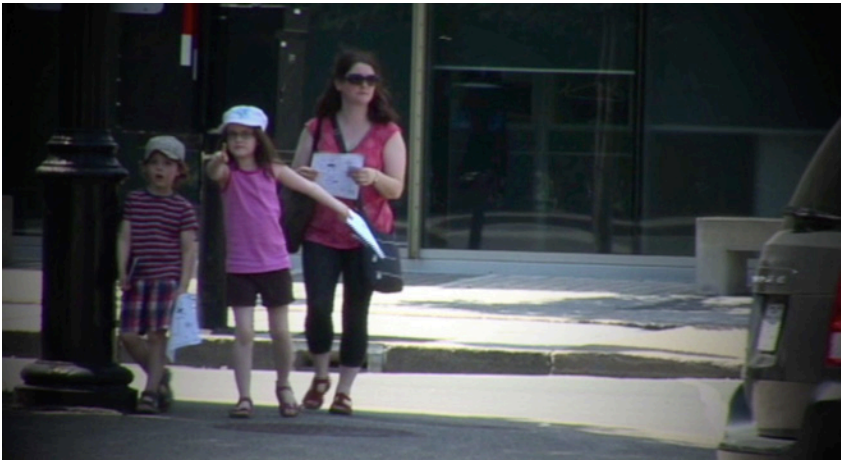
Image 13 - Still from "Pathways", 2014

As Griffintown does not at present have a school or any cultural destinations primarily directed at children, we felt that an urban lab that privileged the experience, responses, and pleasures of young people would be an important launch for our efforts to engage with perspectives not usually heard or seen in the neighbourhood. Our small but enthusiastic group of children and parents consented to being filmed on their walk; this film 45 and ephemera from the lab became the content for this aspect of our exhibition. In the children's collective vision, Griffintown became a dreamscape; not