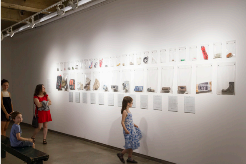
Image 26 - Points de vue, view of the exhibition at the Darling Foundry, 24-28 September 2014.

effectively to a diverse public, while representing a diverse set of participants and intentions. In the case of the third lab, “Archiving urban change”, all participants’ “points of view” were represented in the gallery display, via the artifacts they collected and the written responses we received. In other cases, some curatorial selection was necessary, such as with the “Spatial justice” lab, which relied on photographs taken by participants. Some images were better framed than others and some were out of focus. When it came to representing “Les jeunes/Youth” our team decided that video was our preferred method to communicate the spirit and findings of the lab. The video was suggestive rather than documentary, and so is itself a partial perspective on the events that day. And in the case of the “Urban greening” lab we collaborated on the creation of our display with our two experts, Latour and Hart, who worked with the core curatorial team 55 to make a generous and representative selection for the display. In addition, the participants in each lab