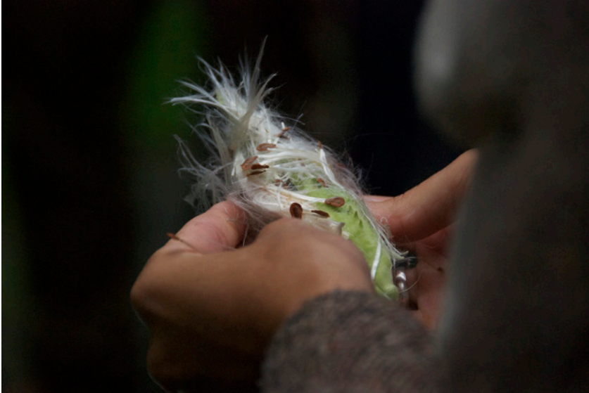
Image 23 - A milkweed bud found on the Urban greening lab, 13 September 2014.