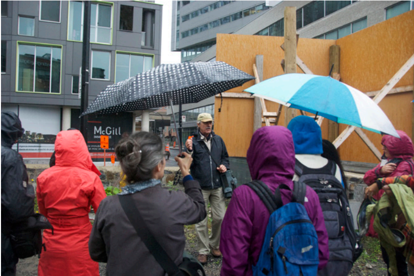
Image 21 - Participants in the Archiving urban change lab seated next to their artifacts and writing reflections, with the tower in the background, 23 August 2014.