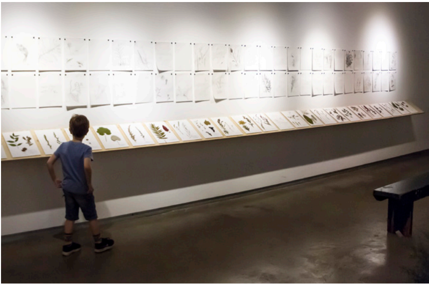
Image 25 – Points de vue , view of the exhibition at the Darling Foundry, 24-28 September 2014.

We had ten days to translate all the outcomes of the urban laboratories into a coherent exhibition that would communicate