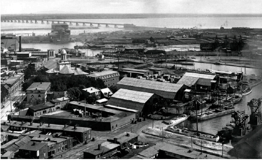
Image 5 - View of Griffintown, c. 1896, towards the South Shore, showing St Ann's Church (demolished 1970), the Lachine Canal and the Peel Basins.

was the greatest in Canada in the second half of the nineteenth century. As early as the 1850s, Griffintown had evolved into a burgeoning working class neighbourhood, built alongside the major industrial installations of the time. This 1896 photograph of Griffintown depicts a line of laundry in the middle foreground, perhaps 20 metres from the nearest shipping basin. This proximity communicates what was once the dense configuration of industry, canal, railway, church, and housing.