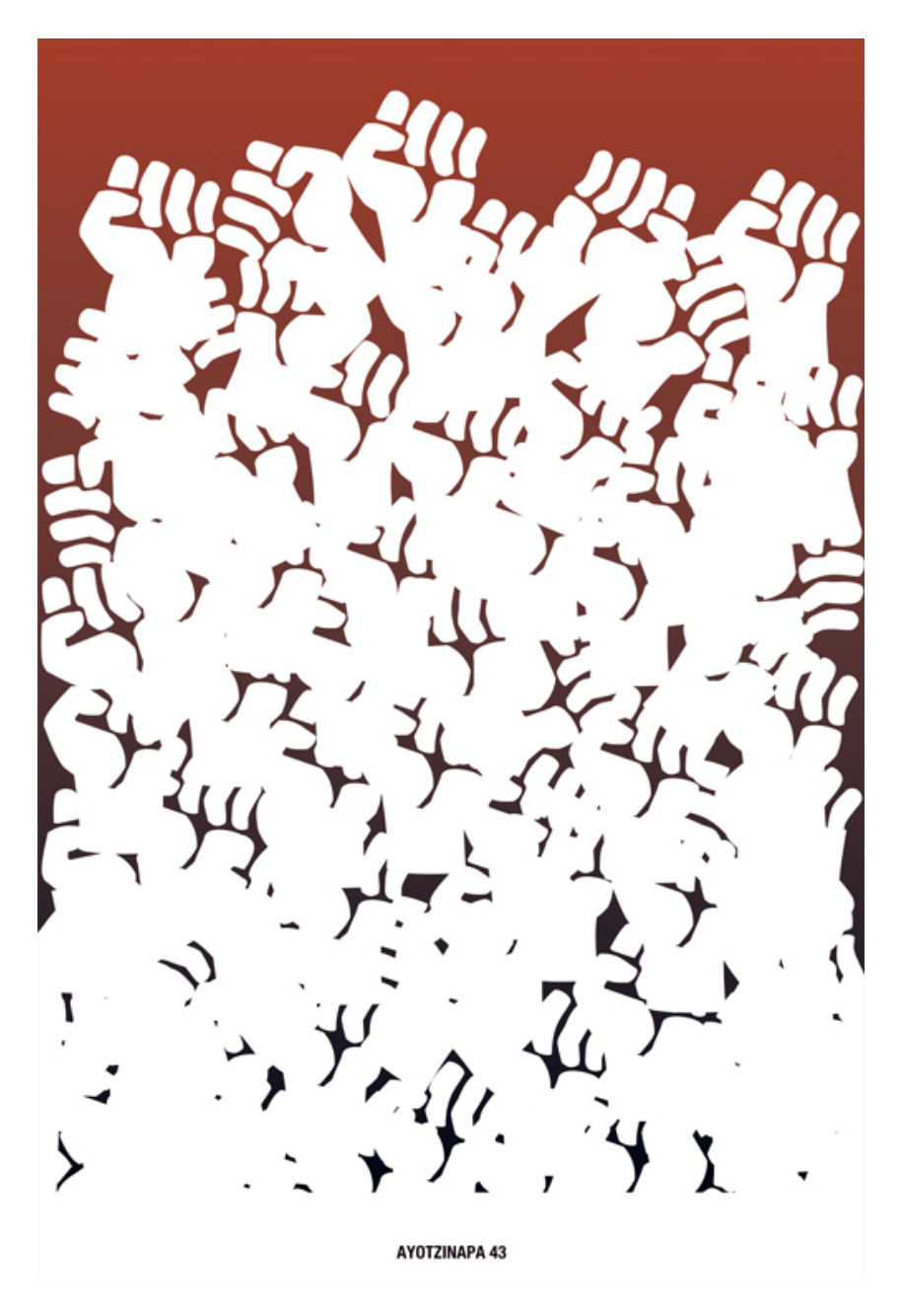
Illustration 2. Amir Khademsharif, Carteles por Ayotzinapa international poster competition in Oaxaca, Mexico, digital print, 60×90 cm.